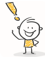
4. Ask questions and make comments during the conversation