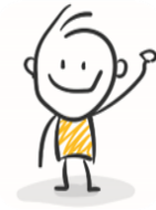
2. Greet the person by saying, "Hi"