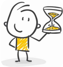
Waiting your turn